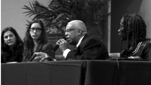
Members of the Albina Ministerial Alliance Coalition for Justice and Police Reform in "From Ferguson to Portland: Race and Police Accountability" (VB #94.5&6)