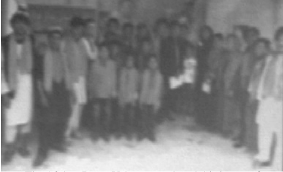
The Afghan Peace Volunteers relayed this image of themselves for their internet call to Portland in "Afghanistan 12 Years Later: The Costs of Endless War" (VB #90.3&4).