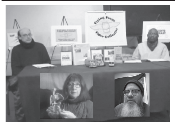
Flying Focus members & producers in a makeshift COVID-safe studio / Zoom call appear on the "Twenty-Ninth Busiversary" (VB #117.7&8)