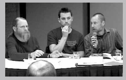
"Project Censored Visits Portland"

News analysis: Portland police and punk-rockers clash. (7/93) Lending Library / Study Guide VB #9.1 $8