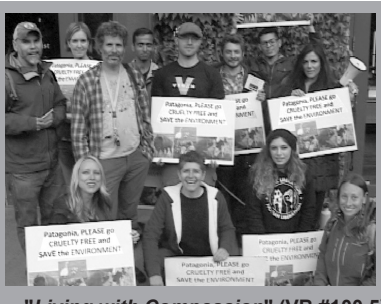
"Living with Compassion" (VB #100.5)

Fur Free Friday in Portland. Demonstrators and passers-by share their views. VB #18.1 $8